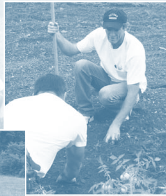
Today our clients, volunteers and staff are tending the garden and hoping for great results.

They have designated a bin for the Hope Center where gardeners place extra produce or items they would like to donate. Each day, one of the gardeners is scheduled to bring produce from the bin to the Hope Center. Between all of our locations, the Hope Center serves approximately 1,200 meals a day. This "bounty" being provided by the gardeners is indeed a blessing to our clients. Many thanks to Beaumont Presbyterian and all the gardeners! 🌱