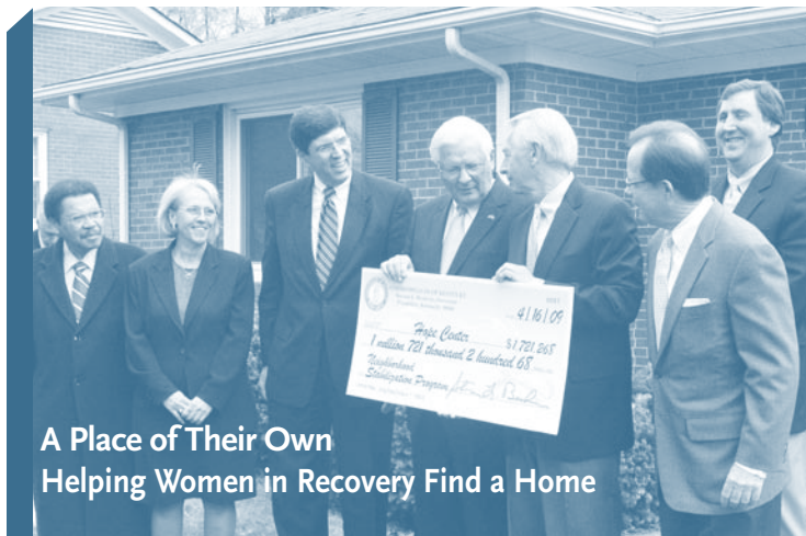
A Place of Their Own Helping Women in Recovery Find a Home